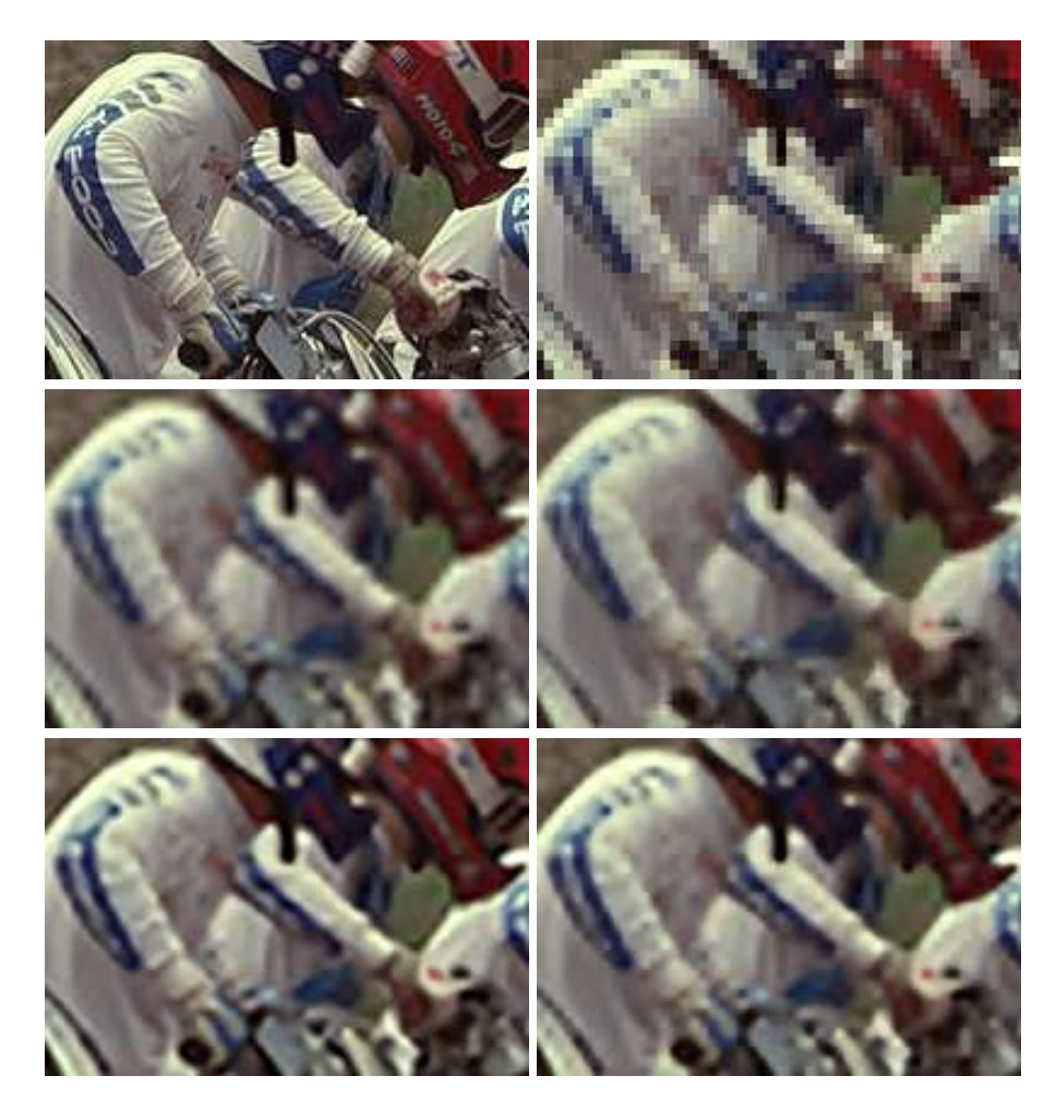
Fig. 2. Upsampling by a factor of four, Detail of the first test image. top left: original high resolution image, top right: nearest neighbor interpolation, middle left: cubic interpolation, middle right: interpolation using GREYCstoration, bottom left: interpolation method proposed by Roussos et. al, bottom right: proposed interpolation method