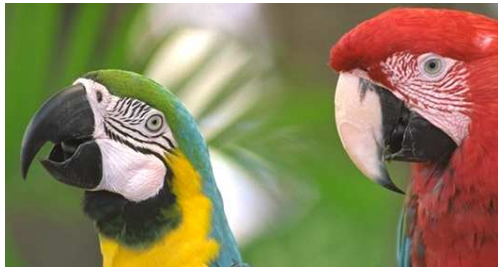
Fig. 1. Two test images. Each test image is available in a low and a high resolution version with a factor of four between both resolution.

second test image, respectively. For GREYCstoration (version 2.9) we use the option '-resize' together with the aimed size of the high resolution image and parameters '-anchor true', '-iter 3' and '-dt 10'. For the remaining parameters the default values are used. The results of Roussos' method were obtained from the web site mentioned above.